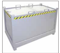
Top: Tipping Guides P.O.A. Middle: With Castor Set Bottom: Galvanized Lid