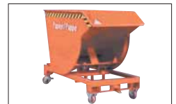
Top: Showing Rolled Tipping Middle: With Galvanized Lid Bottom: With Castor Set