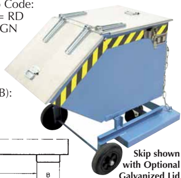
Skip shown with Optional Galvanized Lid