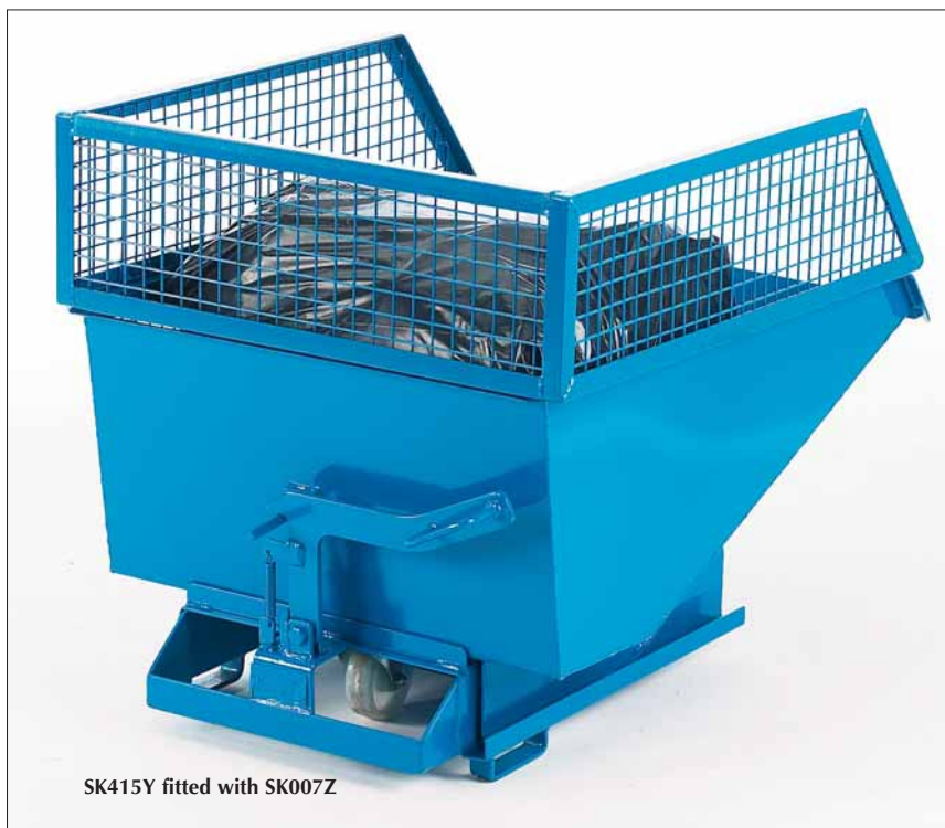
SK415Y fitted with SK007Z