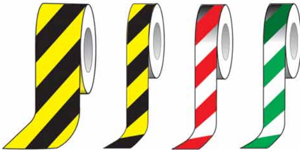
100mm 1-4 = PS98ZX 5+ = PS98ZX5