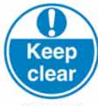
450 dia FLS17X