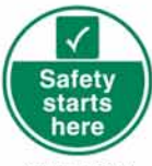
450 dia FLS25X