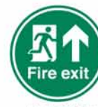
450 dia FLS31X