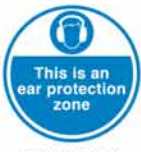
450 dia FLS21X