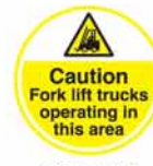
450 dia FLS23X