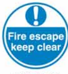
450 dia FLS18X