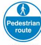
450 dia FLS16X