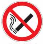
450 dia FLS10X

Material: Strong protective surface to ensure durability and an adhesive backing which is easy to apply and will adhere to most clean and smooth floor surfaces in seconds