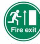
450 dia FLS30X