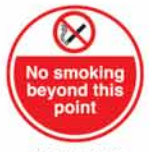
450 dia FLS11X