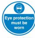
450 dia FLS22X