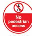
450 dia FLS12X