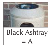
Black Ashtray = A