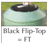
Black Flip-Top = FT