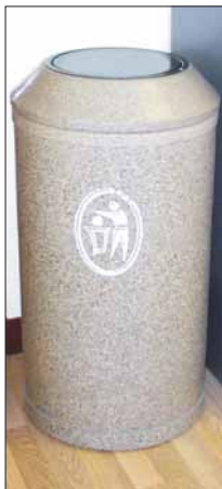
Litter Logo as Standard