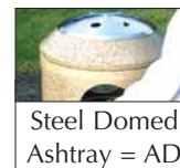
Steel Domed Ashtray = AD