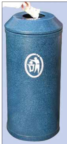
Litter Logo as Standard