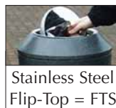
Stainless Steel Flip-Top = FTS