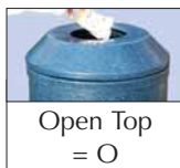
Open Top = O