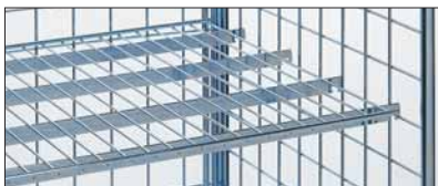
Flat Wire Mesh Shelf Mesh = 35x165mm