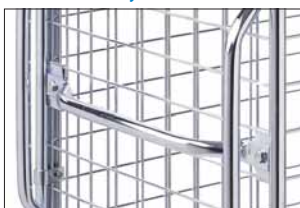
Horizontal and Vertical Handles