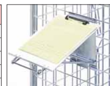
Clip Board Folds Flat - Removable 240 x 310mm